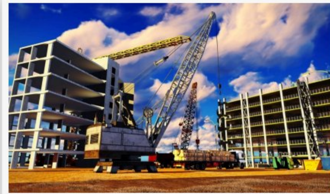
Beverly Suites, Sec-62 Mohali