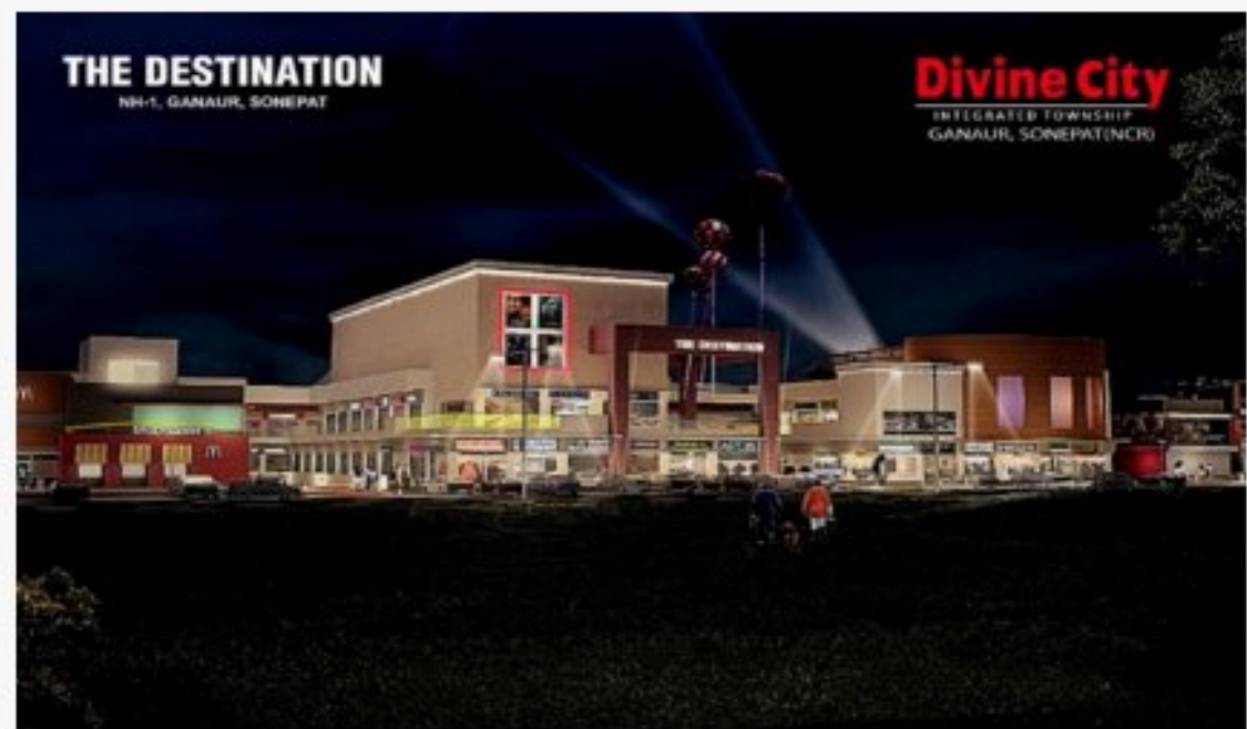
The Destination, Ganaur