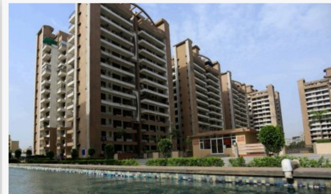
Max Height, Kundli