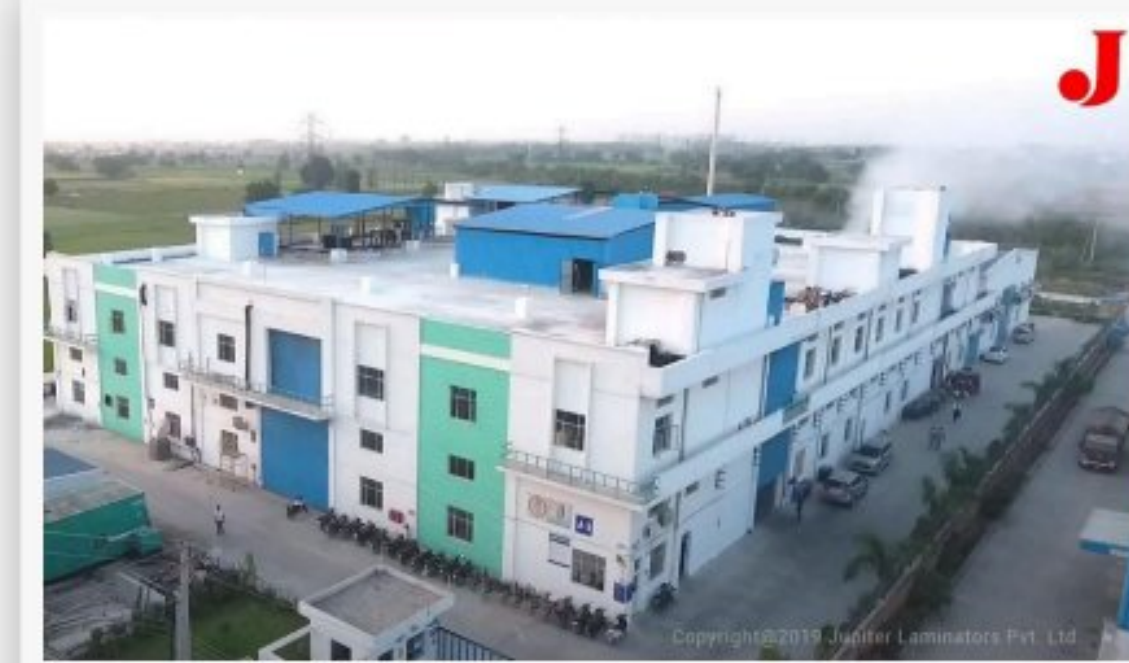
Jupiter Laminators Pvt. Ltd, Bahalgarh Sonipat