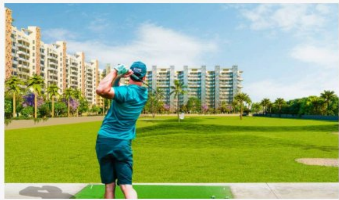
Beverly Golf Avenue, Sec 65, Mohali