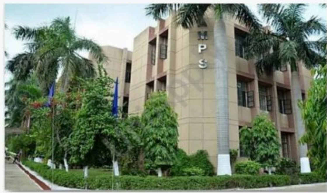
Ashok Memorial Public School, Faridabad